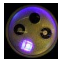
Non-polar GaN LED

Crucially, that impressive conversion efficiency was maintained at much higher currents, with the device emitting 250 mW when driven at 200 mA. Previous efforts have shown promise, but this new result represents a huge increase in output power.